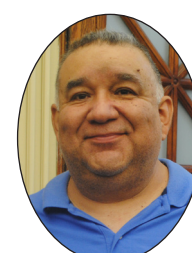
Mr. Atilano Library